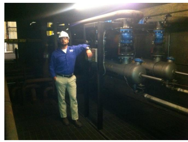
Superior's Capital Improvement Project Manager with two B6-180 model filters.

With self-cleaning water filters, care must be taken to understand the upper levels of particle loading in the water source. The degree of filtration must be selected appropriately so as to set up the filter for success in its operating environment. In other words, the screen must be selected in correspondence with the upper value of inlet particle loading (TSS typically measured in ppm or mg/L).