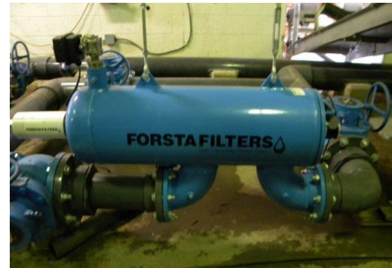
Forsta A6-LP180I-CS model filter at the Throop WWPT. Throop is a 7.0 MGD capacity treatment plant and is one of the three sewage treatment plants of the Lackawanna River Basin's Sewer Authority.