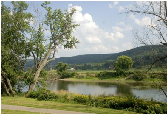
Susquehanna River Bank. The Lackawanna River is a 40.8 mile tributary of the Susquehanna in northeastern Pennsylvania.